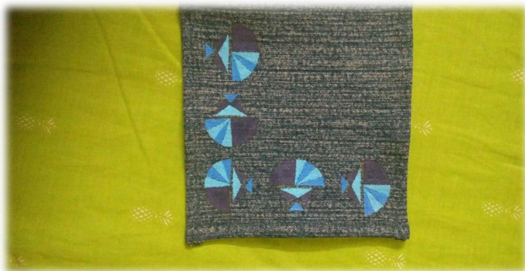
Fabric Painted Coaster