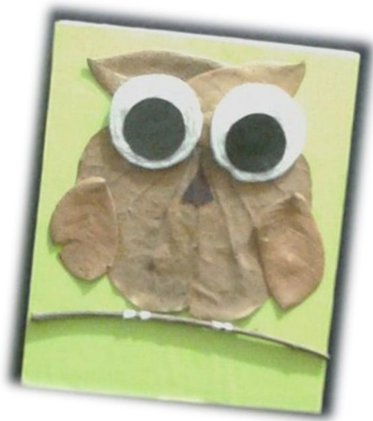
Magnet with recycle material

Creating designed products has long been a part of the curriculum in the Fine Arts department. This year the final year PG students of Economics, English and Mathematics enrolled themselves in an elective course on Creative Design which gave them an exposure to not just design elements but also helped them to create articles using materials as diverse as glass, paper and fabric. The students painted pots and made fabric coasters, stained glass chimes, folders designed with paper and the pièce de résistance, magnets made using materials found on campus as part of our recycling and upcycling efforts! These artworks were all testimony of the students, from such varied backgrounds with little or no exposure to art and design, developing a visual aesthetic. Eventually the students displayed their works and expressed joy and fulfilment in exploring their burgeoning artistic skills.